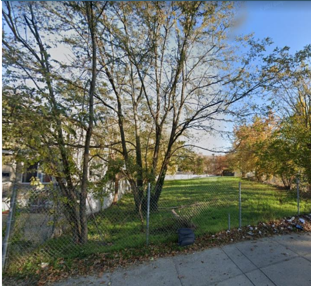
N. Conduit Side