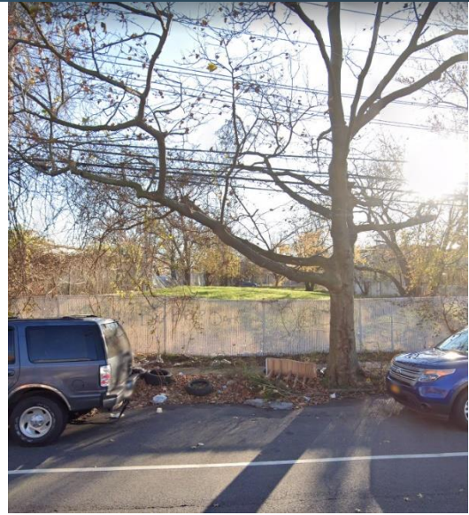
144th Avenue Side